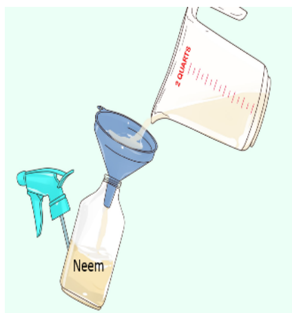
Use neem based and BT based biopesticides for the control of caterpillars