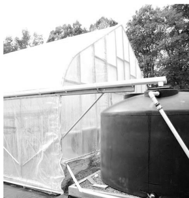
Water tank installed for irrigation.