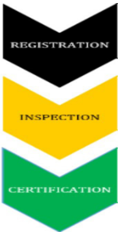
Process in seed certification.