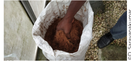
Treat media before use, if used for planting in the previous year.