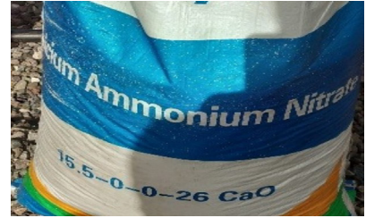
Application of calcium nitrate to grow medium is recommended.