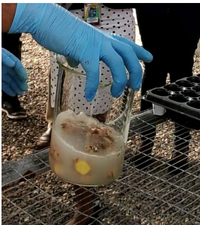
Treat single buds with fungicide before planting.