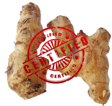
Inspection team visits to assess disease incidence and quality of seedlings at different stages to certify seed rhizome .