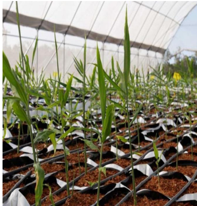
Install drip irrigation facility for shade house production of seed rhizome.