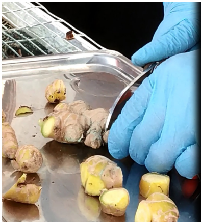
Prepare single bud rhizomes using sterile sharp knife.