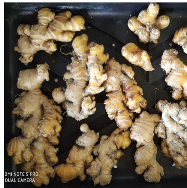
Seed rhizome production for quality and disease free planting material supply

To ensure the production of disease-free subsequent generations of seed rhizome, a standard shade house with a quality production system and adoption of good management practices are necessary. It is in this context that the present manual has been prepared.